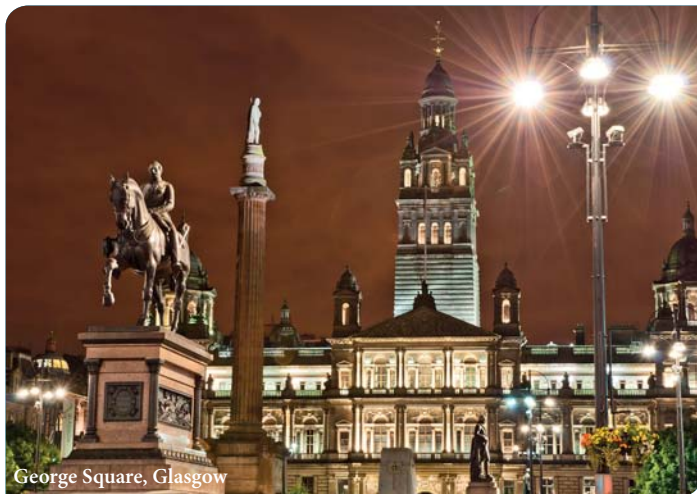
George Square, Glasgow

This lovely tour takes us north to Scotland, where we will stay in Glasgow, full of artistic and architectural heritage as well as visiting Edinburgh with its castle, Royal Mile and gorgeous “new” town, a couple of gardens, taste some whisky (a must!) and cruise on beautiful Loch Katrine – a mini tour that packs in the essentials!