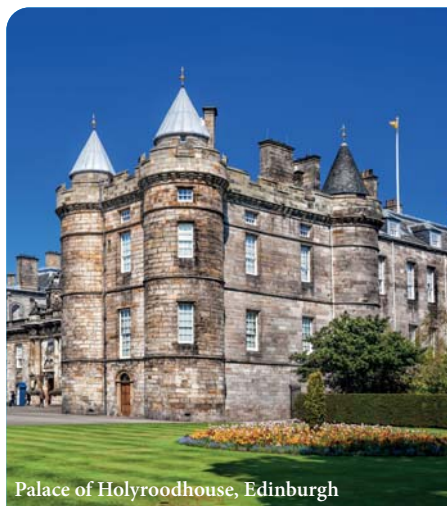
Palace of Holyroodhouse, Edinburgh

Breakfast at the hotel. This morning we head out of the city to beautiful Loch Katrine, the source of much of the city's water supply. A cruise aboard the historic steamship, the Sir Walter Scott will show you its majestic beauty from a wonderfully atmospheric viewpoint. Time for lunch at the Steamship Café on pier on return (not included), before a scenic coach drive within the Trossachs National Park and a visit to a private garden on the way back to Glasgow.