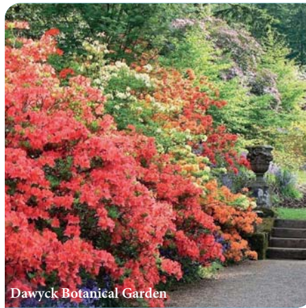
Dawyck Botanical Garden

Breakfast at the hotel. Then we travel south of Glasgow for a full day at Dumfries House, set in 2,000 acres, the estate and 18th