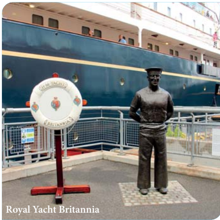
Royal Yacht Britannia