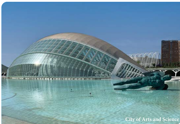
City of Arts and Science

Valencia is fast becoming the must-visit city in Spain and our wonderful tour will show you exactly why its burgeoning reputation is well-founded. One of Europe's best and least known collections of Art Nouveau and Art Deco is augmented by Calatrava's stunning City of Arts and Science, added to a charming old town - right on the Mediterranean - it is a heady, sunny and attractive cocktail. Excellent art galleries open until late and an excursion to the pretty coastal town of Segunto, dating back to Roman times, completes the picture.