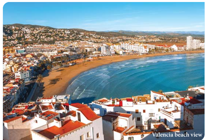
Valencia beach view

This holiday is operated by Travel Editions Group Travel