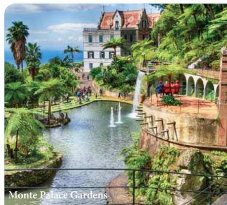
Monte Palace Gardens