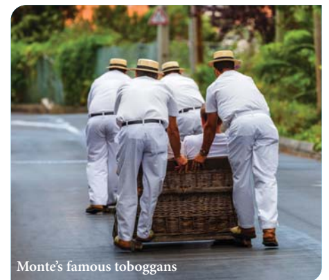
Monte's famous toboggans

This holiday is operated by Travel Editions Group Travel