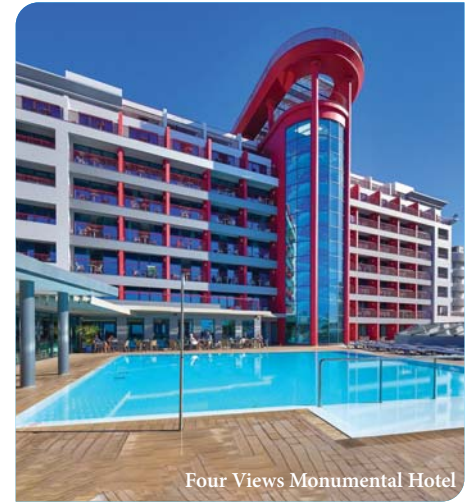
Four Views Monumental Hotel

This modern, four-star hotel offers a high standard of comfort and services in the Lido area of Funchal about 3km from the city centre, overlooking the Atlantic. Facilities here include "Award's" bar, Atlantic Dream restaurant, pool bar, indoor and outdoor heated pool, gym, beauty centre, games room and spa. All rooms are comfortable with all modern amenities and have a balcony with a view over the mountains or the sea.