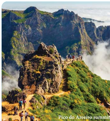
Pico do Areiro summit

Transfer to the airport for the return flight to Heathrow.