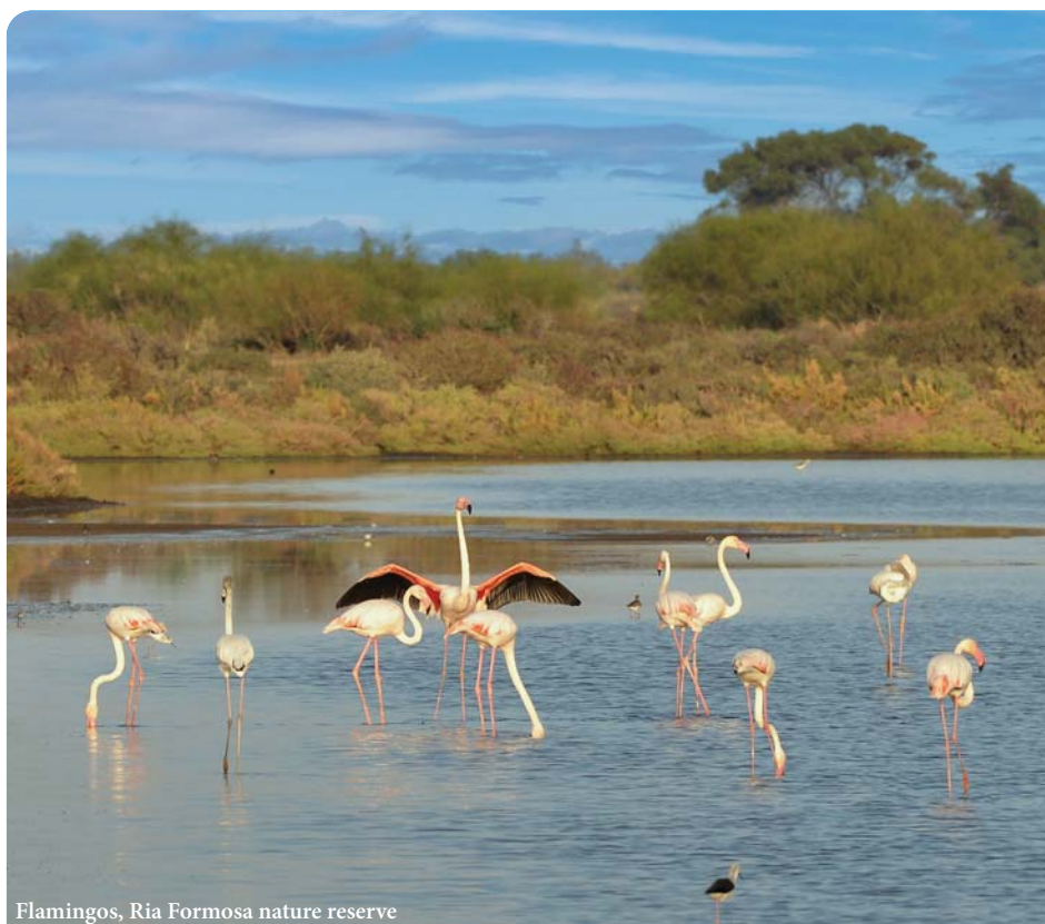
Flamingos, Ria Formosa nature reserve