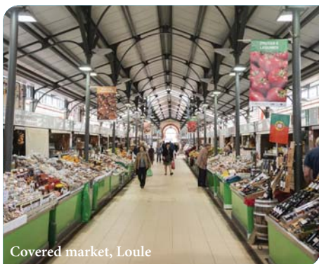
Covered market, Loule

After lunch we then head to the authentic Portuguese market town of Loule with its characterful historic centre. Loule is a wonderful place to experience authentic Portuguese life. The focal point of Loule is the Arabian inspired covered market, with stalls selling fresh produce and regional handicrafts. Surrounding the markets are tree-lined plazas and a warren of alleys, barely altered since the medieval period. Within the historic centre is an ancient castle, Gothic church and traditional tradesmen's houses. We then round off our day with a visit to the renowned family-owned winery of