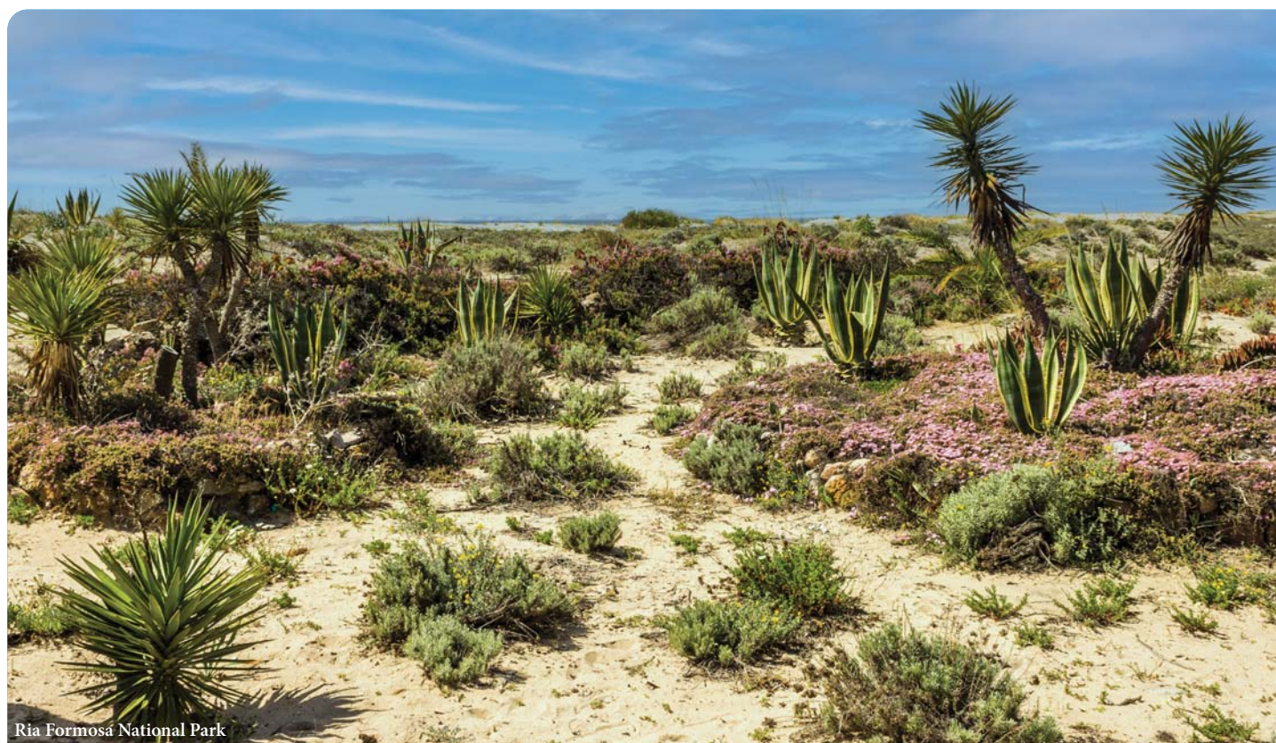
Ria Formosa National Park

Our penultimate day sees us meandering with the River Guadiana through its fascinating marshland and across the border into Spain. In the morning our excursion begins with a short walk in the Sapal of Castro