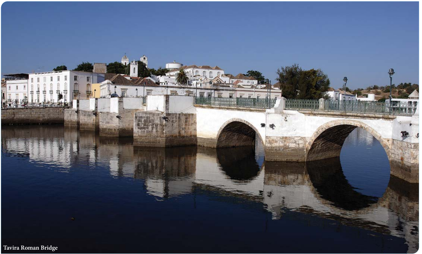
Tavira Roman Bridge