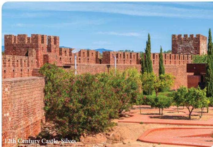
12th Century Castle, Silves

We visit quaint fishing villages, authentic market towns, local museums and an award-winning olive oil farm. We also cross the border into Spain to visit the charming old quarter of Ayamonte. We're confident that this varied and well-balanced tour will provide memories that will stay with you long after your trip.