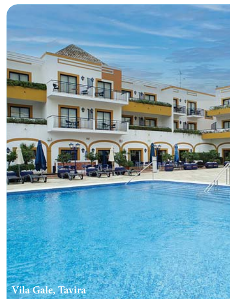
Vila Gale, Tavira

Located in the heart of the historic town of Tavira, the four-star Vila Gale Hotel offers spacious and comfortable rooms, as well as a restaurant, bar, outdoor pool and a health club. All rooms have private en-suite bathrooms as well as TV, free wifi, air-conditioning and hairdryer.