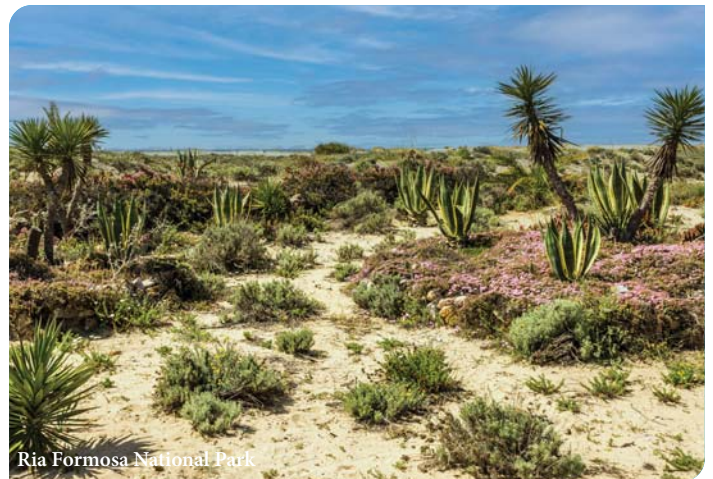
Ria Formosa National Park

This holiday is operated by Travel Editions Group Travel