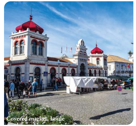
Covered market, Loule

restaurant in Castro Marim or Vila Real Santo Antonio. After lunch we venture onto the public boat to cross the border into Spain and to the town of Ayamonte. We head into the charming old quarter and visit the medieval hilltop castle of Castro Marim, once a stronghold of the Knights Templar. Ayamonte is home to the 16th century Iglesia de San Francisco and 15th century Iglesia de San Salvador with its wonderful Mudejar ceiling. You might wish to ascend its tower to enjoy wonderful views back across to Portugal. We will round off our day with an opportunity to sample the famous 'Jamón Iberico' with a glass of local wine (included). We return to our hotel for our farewell dinner at a local restaurant in Tavira.