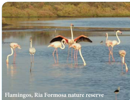
Flamingos, Ria Formosa nature reserve

Our penultimate day sees us meandering with the River Guadiana through its fascinating marshland and across the border into Spain. In the morning our excursion begins with a short walk in the Sapal of Castro Marim Nature Reserve. Here the river winds its way through the plains, branching out into creeks and canals that flow into lakes, marshland and salt pans. Much of the reserve still operates in salt production and you will learn how table salt has been produced here for more than 2000 years. The mudflats and lagoons are of immense importance to resident and visiting birds. It serves as a nesting and wintering area to a wide variety of species. Here, it is possible to spot birds throughout the year, such as the white stork, flamingo and the black-winged stilt (the Reserve's most common species and therefore the symbol of the Nature Reserve) This outstanding area was declared a nature reserve in 1975 and covers over 2000 hectares. Time for lunch is provided (not included) at a local