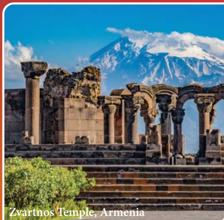
Zvartnos Temple, Armenia