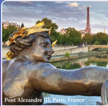
Pont Alexandre III, Paris, France