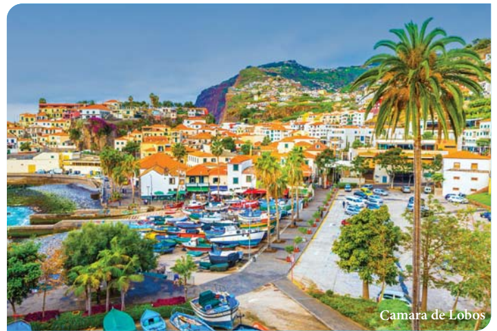
Camara de Lobos

This holiday is operated by Travel Editions Group Travel