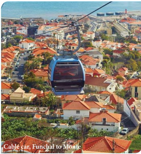
Cable car, Funchal to Monte