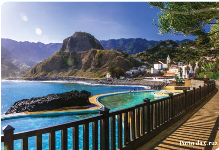
Porto da Cruz

The lush, volcanic Portuguese island of Madeira lies 400 miles off the coast of Africa and is 36 miles by 14 miles of outstanding natural beauty. Its warm, temperate climate makes it a verdant, sub-tropical paradise that is a delight to visit at any time of year. Much of Madeira has been designated a conservation area and it displays a wealth of superb flowers blooming effortlessly throughout the year. There are plenty of cultural sights too, particularly in the capital, Funchal, which has good museums, an impressive cathedral, farmer’s market and lots of excellent restaurants. A range of excursions will show you the highlights of the island, leaving some time for personal exploration or simply to relax at the hotel.