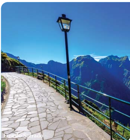
Eira do Serrado

Staying on an island surrounded by thousands of miles of ocean, it makes sense to have a view of Madeira from a