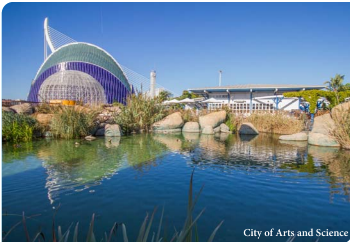
City of Arts and Science

Valencia is fast becoming the must-visit city in Spain and our wonderful tour will show you exactly why its burgeoning reputation is well-founded. One of Europe's best and least known collections of Art Nouveau and Art Deco is augmented by Calatrava's stunning City of Arts and Science, added to a charming old town - right on the Mediterranean - it is a heady, sunny and attractive cocktail. Excellent art galleries open until late and an excursion to the pretty coastal town of Segunto, dating back to Roman times, completes the picture.